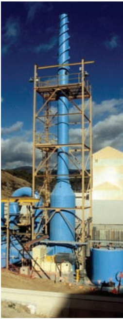
Series 9000 Preformed Spray Scrubber